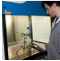
AIR FLOW SPEED TEST