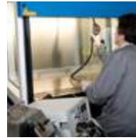
NOISE LEVEL TEST

Each Faster cabinet is tested conforming to EN 12469:2000, EN 61010:2001 and released with FAT certificate of the tests performed.