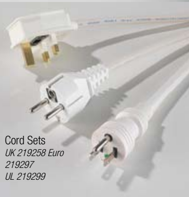
Cord Sets UK 219258 Euro 219297 UL 219299

A wide choice of accessories - allows you to specify the model to suit your exact needs.