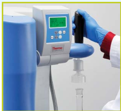
Exact dosing with easy push-button dispensing