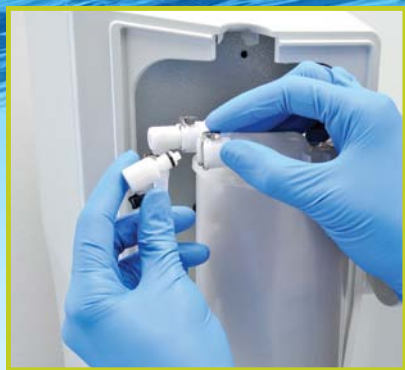
Quick connect cartridge replacement

Contact your sales representative for details.