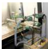
KI DISCUSS TEST