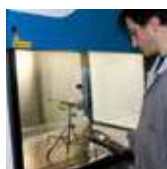
AIR FLOW SPEED TEST

Each Faster cabinet is tested conforming to EN 12469:2000, DIN 12980:2005, EN 61010:2001 and released with FAT certificate of the tests performed.