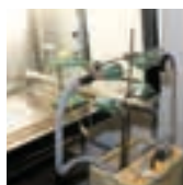
KI DISCUSS TEST