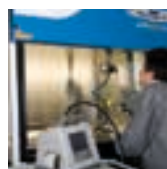
FILTER LEAKAGE TEST