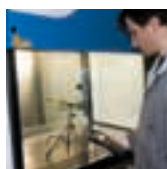
AIR FLOW SPEED TEST

Each Faster cabinet is tested conforming to EN-12469:2000, DIN-12980:2005 EN-61010:2001 and released with FAT certificate of the tests performed.