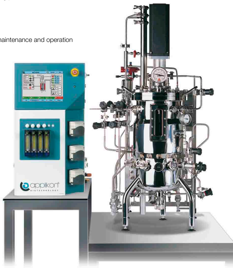
15 Liter BioBench with ez-Control