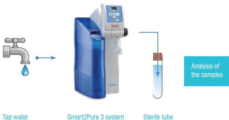
Figure 1. Diagram of a Smart2Pure water system with a 6 L internal reservoir.